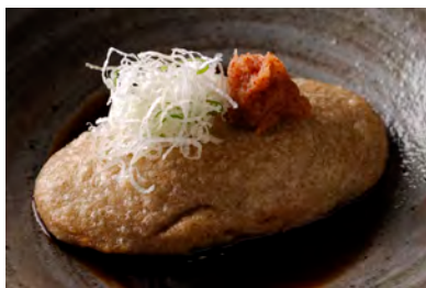
Sobagaki Agedashi そばがき 揚げ出し