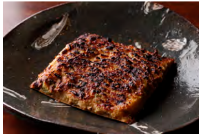
Yaki Miso 焼き味噌

Grilled Miso (soybean paste) with many roasted buckwheat seeds.