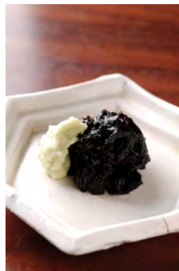
Wasabi Nori わさび海苔